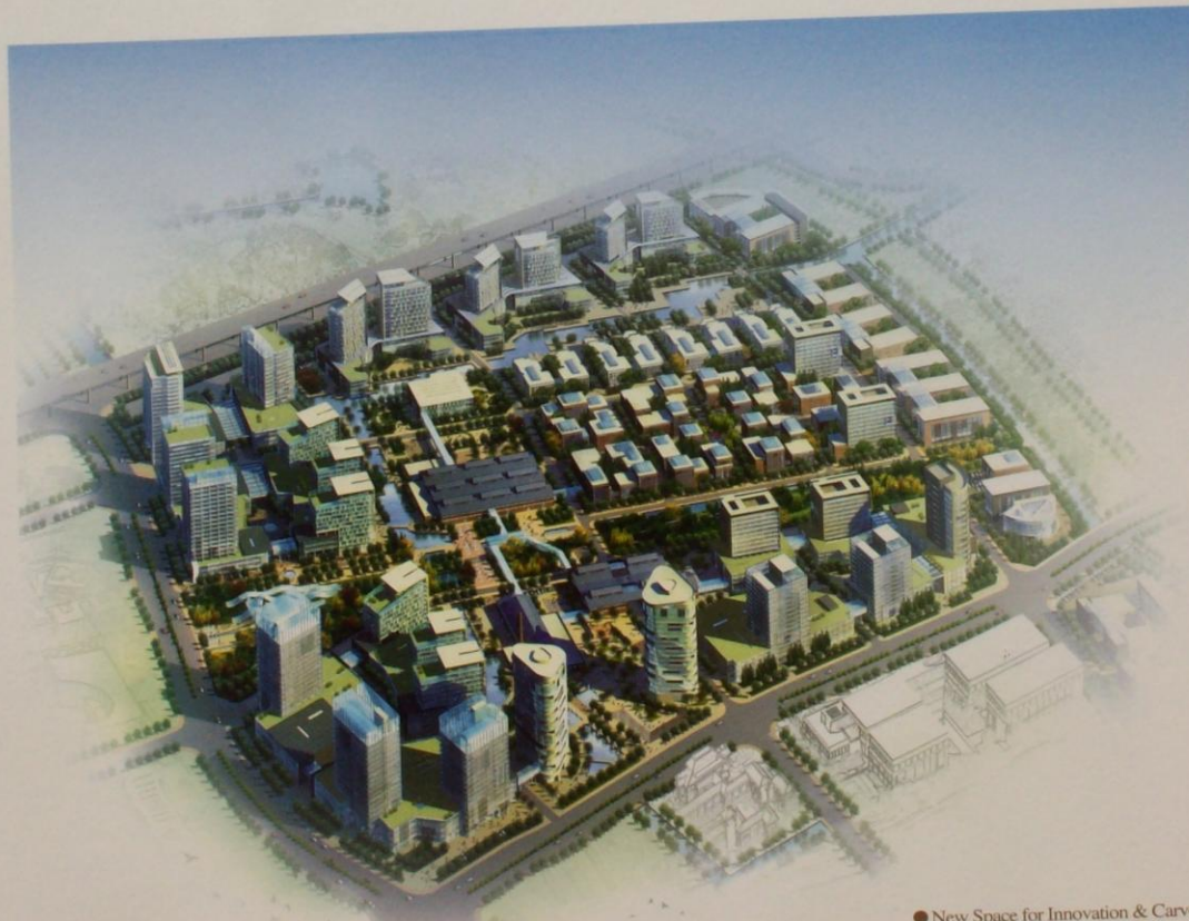
● New Space for Innovation & Carve Out